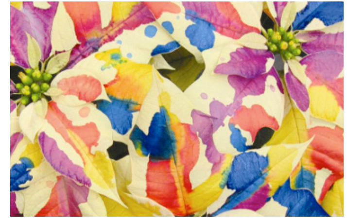
Market this idea for children, Gen Z, and New Year's