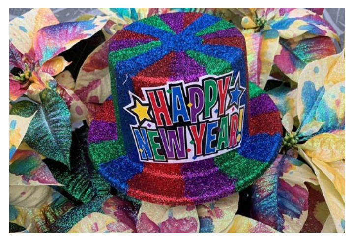
*Note the retail price for a 6.5-in./17-cm pot!