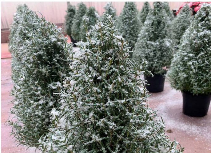
Note: Fañfasy Colors™ Glue, Fañfasy Colors™ Snow Powder and Iridescent glitter can be used on rosemary trees.